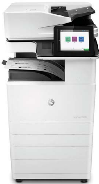
HP LaserJet Managed MFP E72530dn

Businesses that stay ahead don't slow down. It's why HP built the next generation of HP LaserJet MFPs—to power productivity with a streamlined design that delivers premium quality, maximum uptime, and the strongest security. 1