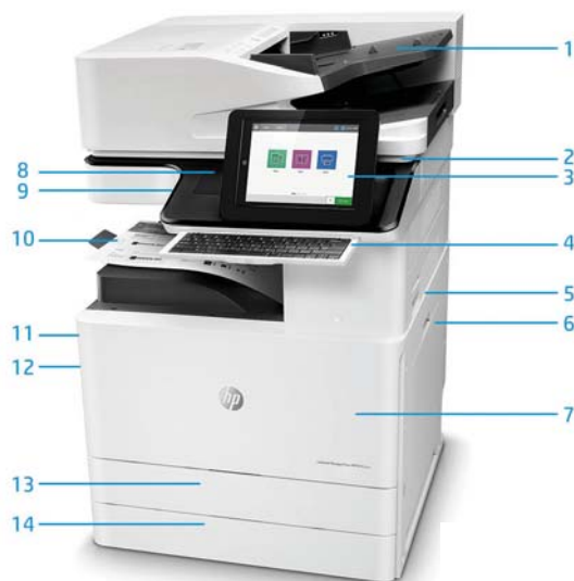
HP LaserJet Managed Flow MFP E72530z