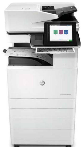
HP LaserJet Managed Flow MFP E72530z